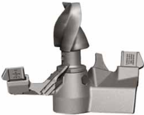
Trimax® Weld-On Boring Heads